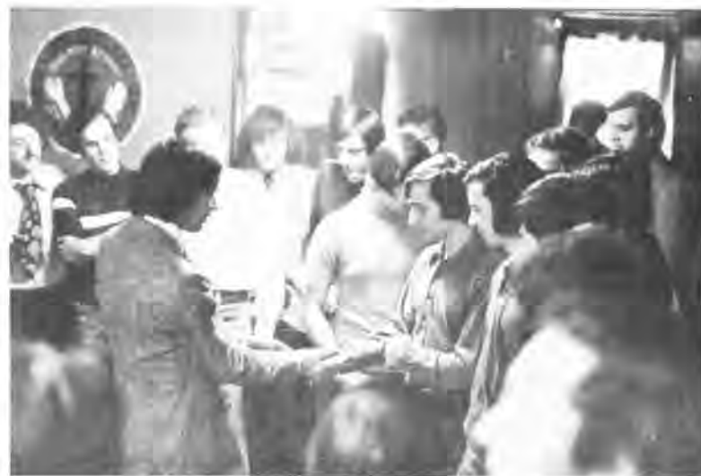
At a recent initiation of Beta Sigma, many National Officers were present, including the National President.