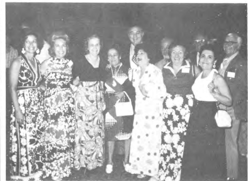
No — it's not a fashion show. It's a gathering of part of the Santangelo crowd.