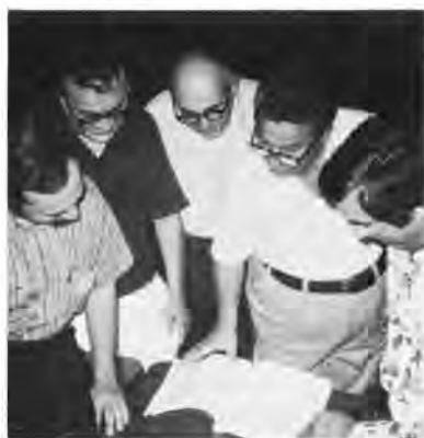
National Officers get their first look at The History of Alpha Phi Delta.