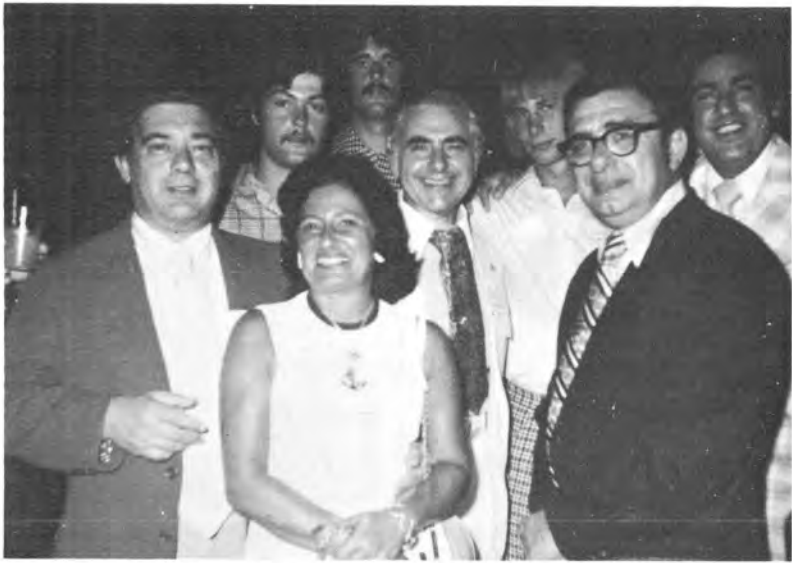
Our First Lady poses with some of her favorite men.