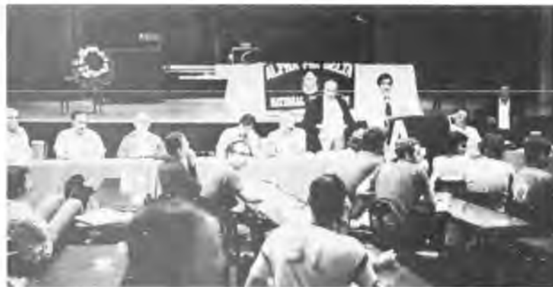
The National Council in session. This particular photo was taken during the Expansion Committee report.