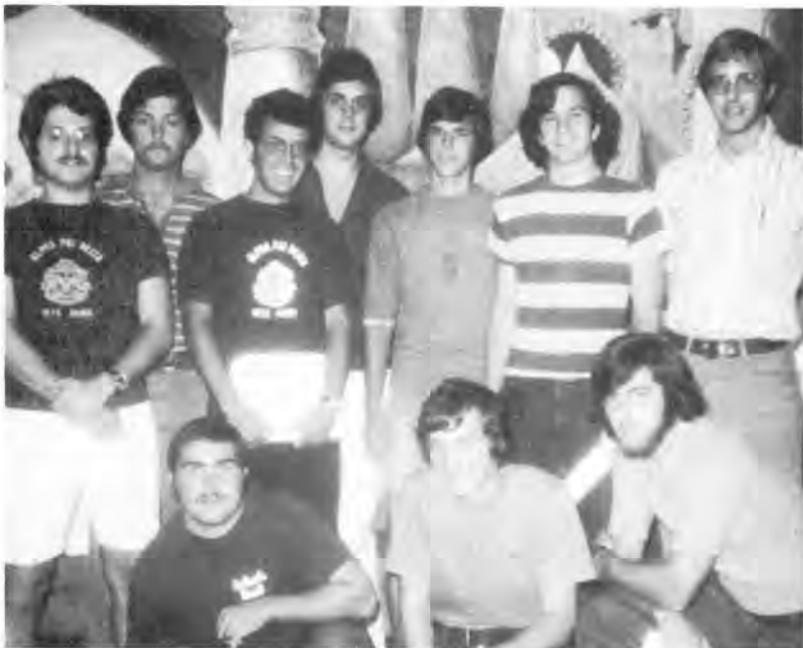
The first group picture of the new Undergraduate Co-ordinating Committee.