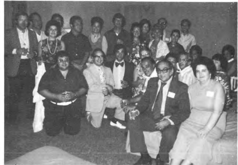
This is one of those many before and after dinner gatherings at the National Convention.